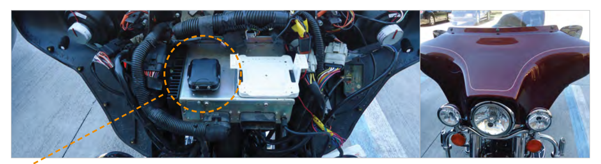
SPOT Trace mounted under the fiberglass fairing of a motorcycle using the included Velcro strip and mounting bracket.