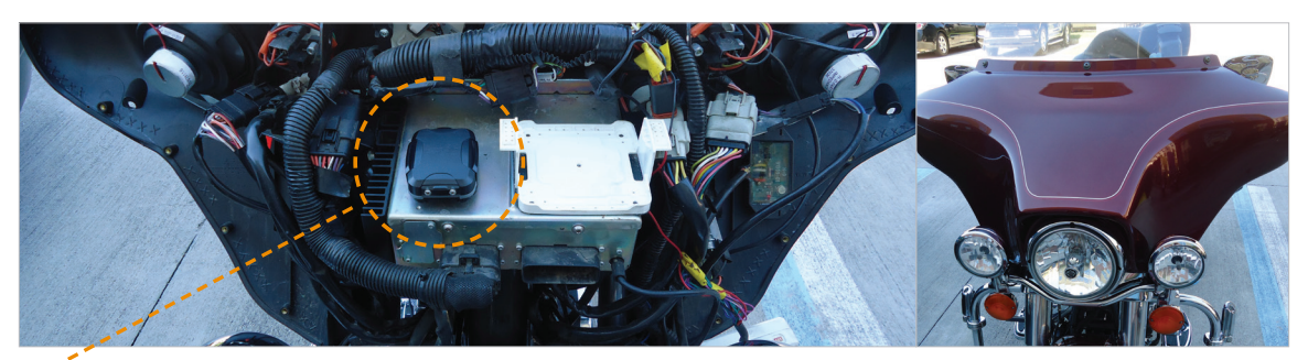
SPOT Trace mounted under the fiberglass fairing of a motorcycle using the included Velcro strip and mounting bracket.